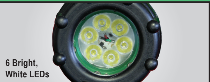
6 Bright, White LEDs