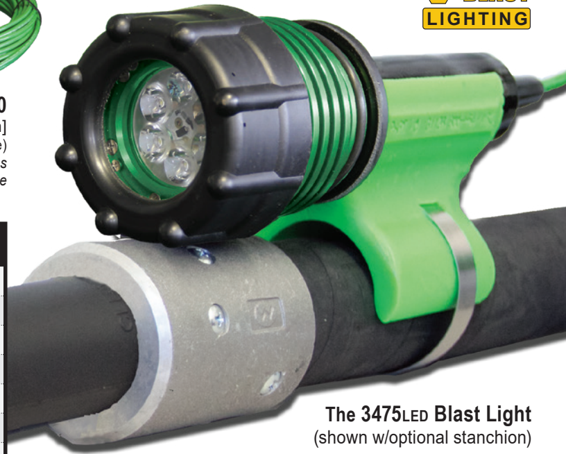
The 3475LED Blast Light (shown w/optional stanchion)