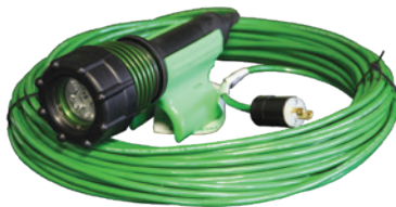
Model 3475-80 [Non Power Box Option] (LED Blast Light, Cable) various cable lengths & plug options available