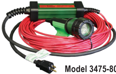
Model 3475-80/S [Complete System Option] (LED Blast Light, Cable, Power Box, & Plug) various cable lengths available