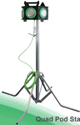
Quad Pod Stand