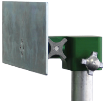
SITE LIGHTs Quad Pod Topper